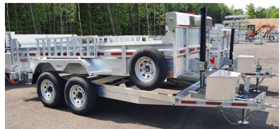
Available option: Ramps, rear leg stabilizer, spare and mount