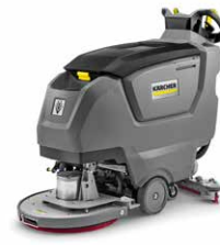
B 50 W BP R55 AGM (CYLINDRICAL)