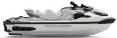
○ White Pearl Premium