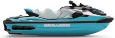
● Teal Metallic