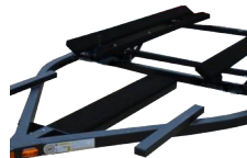
Center Walkway Kit