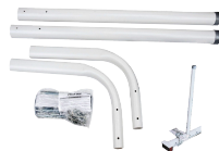
PVC Load Guides 44"