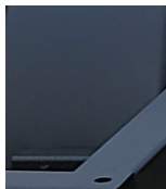
Polyester Black Powder Coat Paint