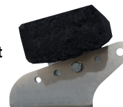
Adjustable Target Bunks