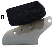
Easy Adjustable Bunk Brackets