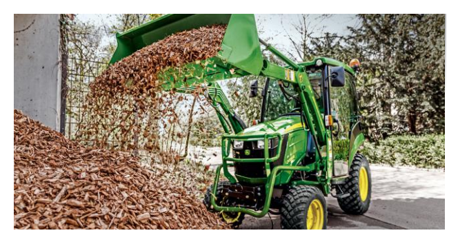
220R Loader. For 2032R and 2038R Compact Tractors.