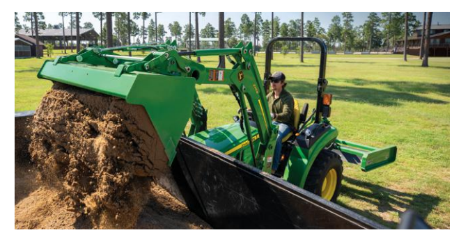
120R Loader. Available on the 2025R and 1 Series Sub-Compact Tractors.

Everything from buckets to pallet forks to grapple attachments. Loader work is 2 Series territory.