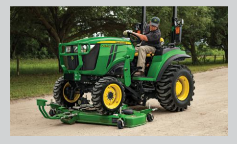
Optional Drive-Over Mower Deck. The cut is great. Drive-over mower deck, 7-Iron Commercial quality mower decks and rotary cutters are all options.