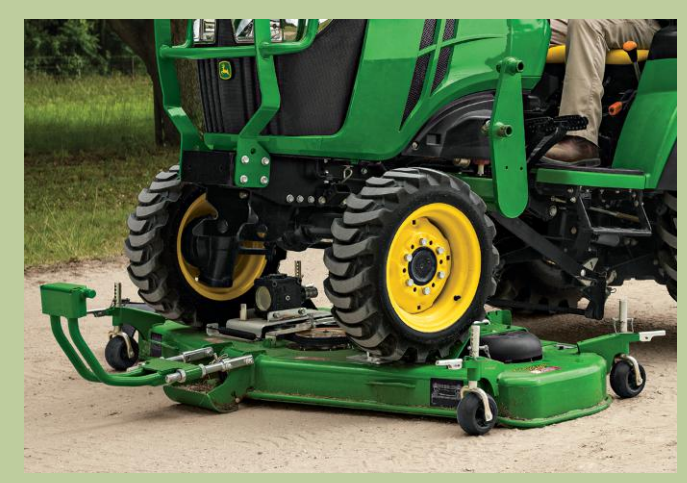
The AutoConnect™ Drive-over Mower Deck option is easy. Ready. Set. Mow. The available drive-over mid-mount deck option features an independent lift system, so you can attach and mow even with your loader and a rear implement installed. Not all Compact Utility Tractors can do that