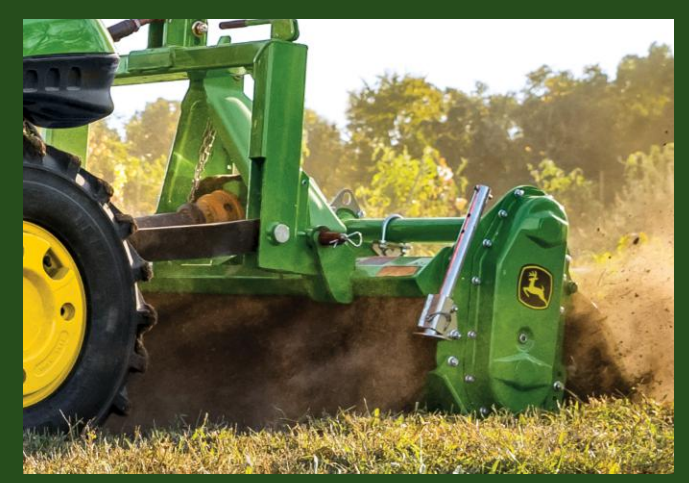
The iMatch™ Quik-Hitch is a great start. Attach Category 1, 3-Pt Hitch implements to the back of your tractor easily with just a single connection point thanks to iMatch™. Then add a 3-Pt Hitch to the front to attach a broom, blade, snowblower or other frontmounted implement quickly and easily.