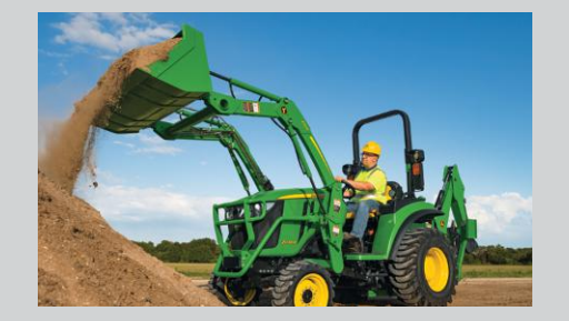
The ultimate loader option machine. First choose between Mechanical Self-Leveling (MSL), the easy way to lift a load levelly, and Non-Self-Leveling (NSL) options. Add a bucket or pallet forks. The lift capacities are strong. The easy attach/detach option is even stronger. Available on 220R Loaders.