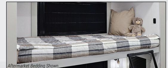
Aftermarket Bedding Shown