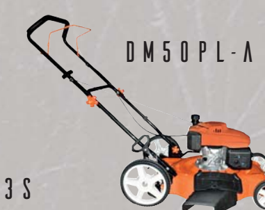
D M 5 0 P L - A