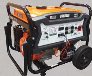
D G 6 5 0 0