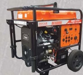
D G 1 5 0 0 0 E