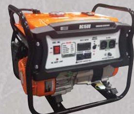
D G 1 5 0 0