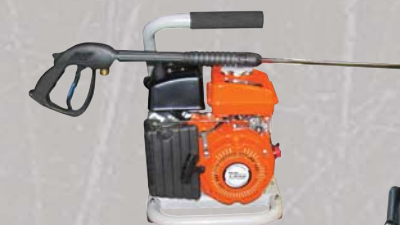
R 1 0 0