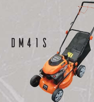
D M 4 1 S