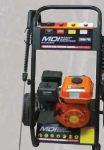
M D I 2 9 0 0 - L