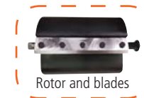
Rotor and blades