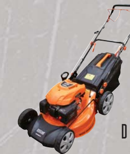
D M 5 3 S