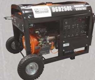
D G 9 2 5 0 E H D