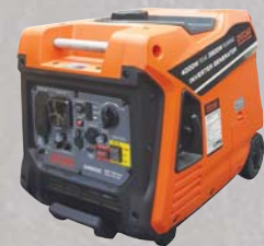
D 4 0 0 0 i