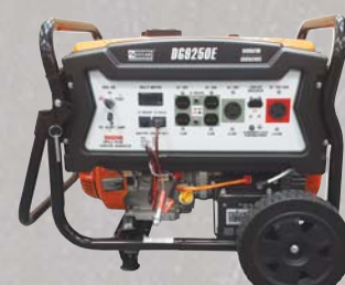
D G 9 2 5 0 E