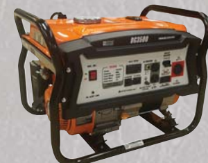
D G 3 5 0 0