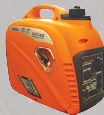
D 2 0 0 0 i S