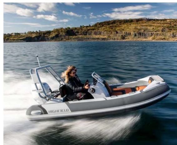
SPORT 390 with optional roll bar

Brushed EVA teak flooring, internal LED convenience lighting, recessed cleats & high quality upholstery set this range apart from the competition. Roll bars with mounted stern light and sun deck cushions available as options.