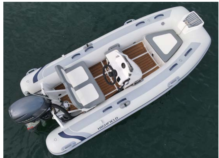
CLASSIC 360 with GT PACKAGE