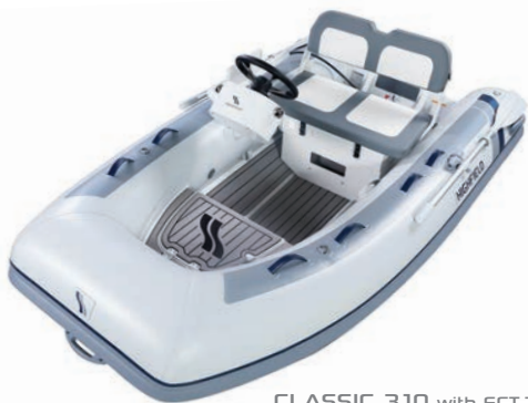
CLASSIC 310 with FCT-7

Designed to fit the CL 290 thru 380, the FCT-7 console is an all-in-one seating and steering approach, with built-in navigation lights and switches.