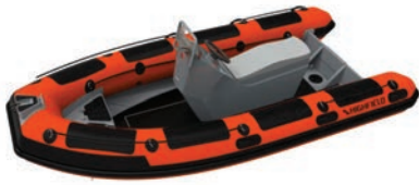
PATROL 460 w/jockey console

The PATROL series offers a range of customizable cockpit layouts, giving you a number of options for what kinds of seating and steering set-up you want, ideal for yacht club chase boats, expedition operators, or private owners looking for the ultimate in a big, powerful RIB.