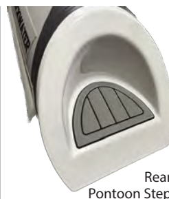
Rear Pontoon Step