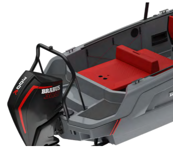
MULTI-STORAGE COMPARTMENT PLATINUM GREY BRABUS RED

UPHOLSTERY: BRABUS RED HULL COLOUR: PLATINUM GREY HULL GRAPHIC: EDITION ONE GRAPHIC