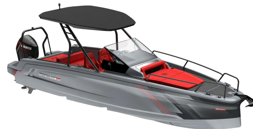
BRABUS SHADOW 300 CROSS-TOP EDITION ONE W. MULTI-STORAGE COMPARTMENT

Sleek, inspiring and ultra-agile — The Shadow 300, available as Cross-Bow or Cross-Top model, offers endless possibilities. Designed to inspire anyone, no matter the boating experience, to spend exhilarating moments out on the water, the BRABUS Shadow 300 range is the right choice for discerning powerboat enthusiasts worldwide.