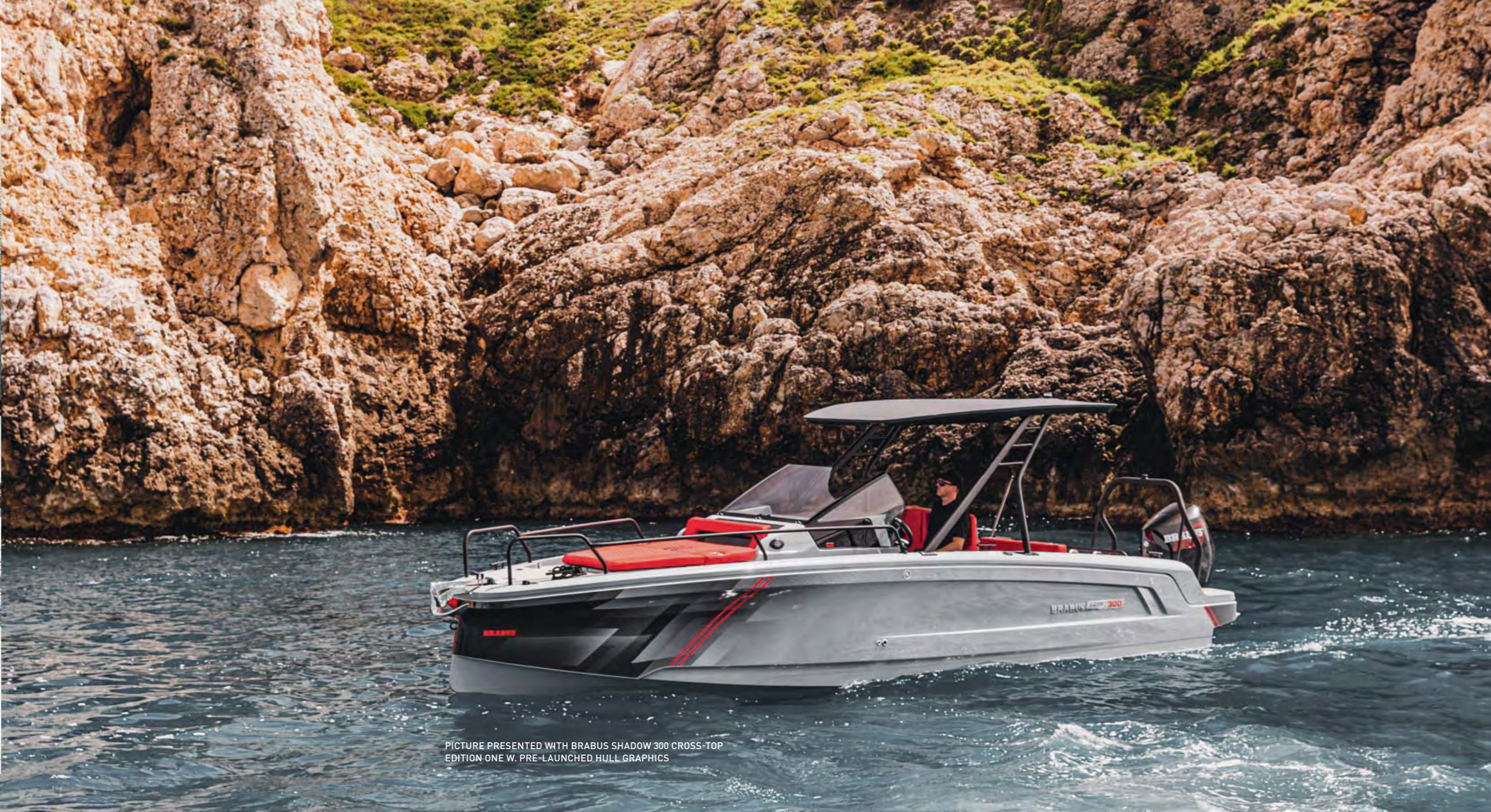
PICTURE PRESENTED WITH BRABUS SHADOW 300 CROSS-TOP EDITION ONE W. PRE-LAUNCHED HULL GRAPHICS