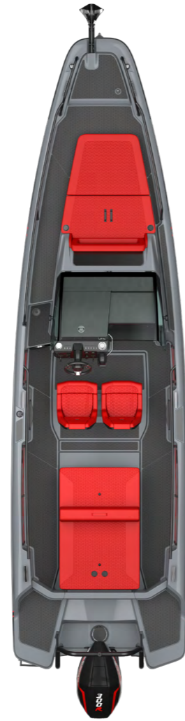
SHADOW 300 MULTI-STORAGE COMPARTMENT BRABUS RED