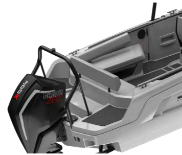
U-SOFA LAYOUT QUANTUM WHITE BRABUS PLATINUM

UPHOLSTERY: BRABUS PLATINUM HULL COLOUR: QUANTUM WHITE HULL GRAPHIC: QUANTUM WHITE GRAPHIC