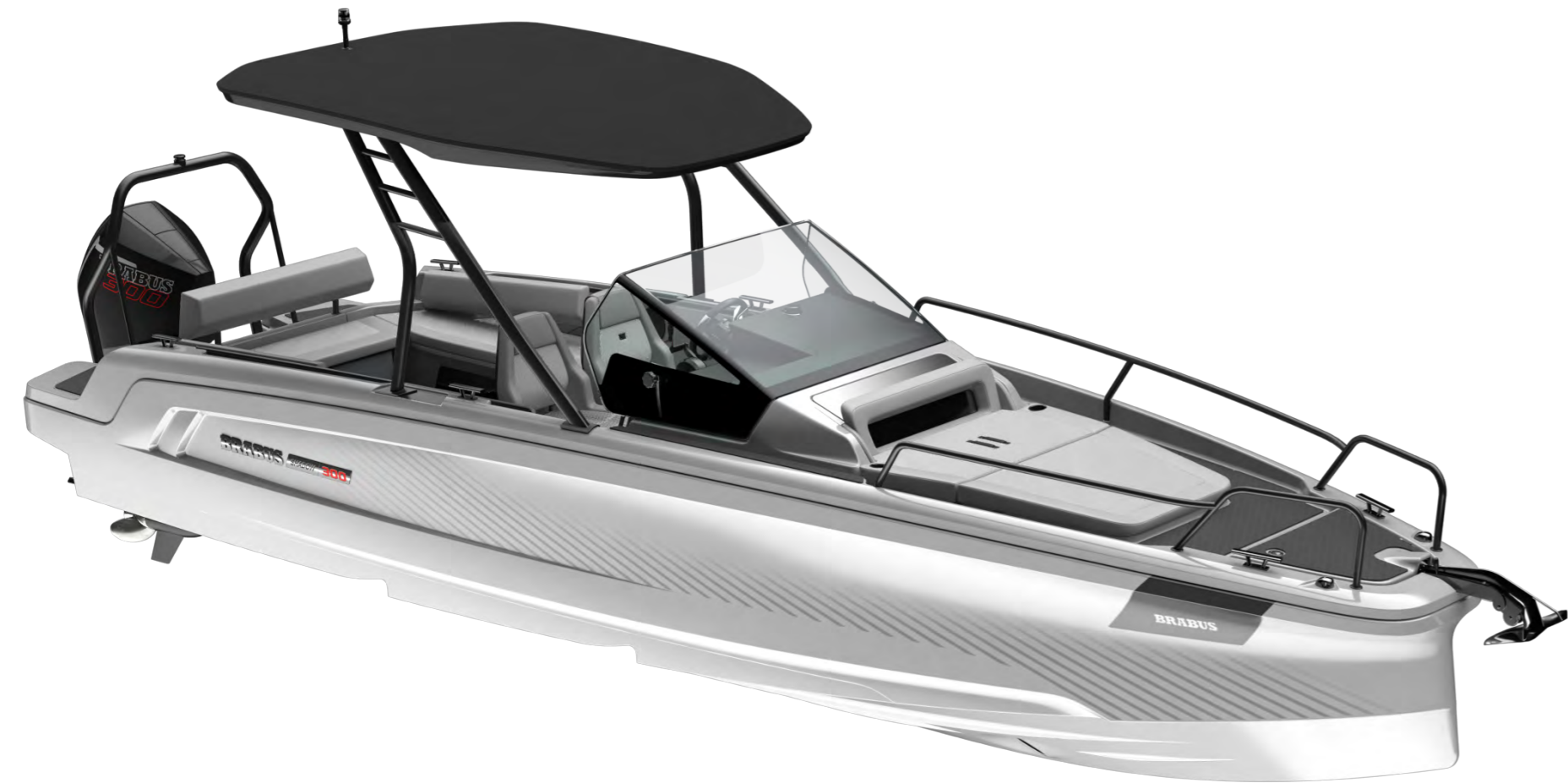
BRABUS SHADOW 300 CROSS-TOP IN QUANTUM WHITE W. U-SOFA LAYOUT