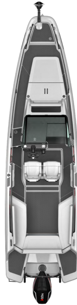
SHADOW 300 U-SOFA LAYOUT BRABUS PLATINUM