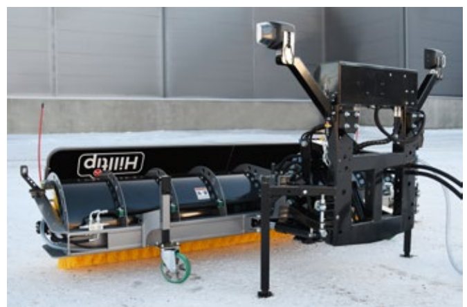
SweepAway™ 3100 rotary broom with light tower