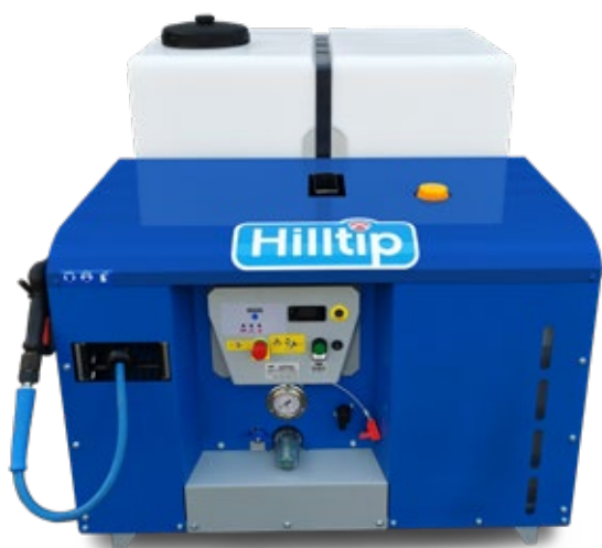
WeedStriker™ hot water weed control unit

The sprayer is equipped with a hot water boiler and a 12V water pump powered by batteries, allowing for several hours of operation. The boiler's fuel pump is a high-performance two-step pump that maintains a consistent temperature of 98°C. Optionally controlled via smartphone using the StrikeSmart™ App , which connects to the cloud-based HTrack™ system .