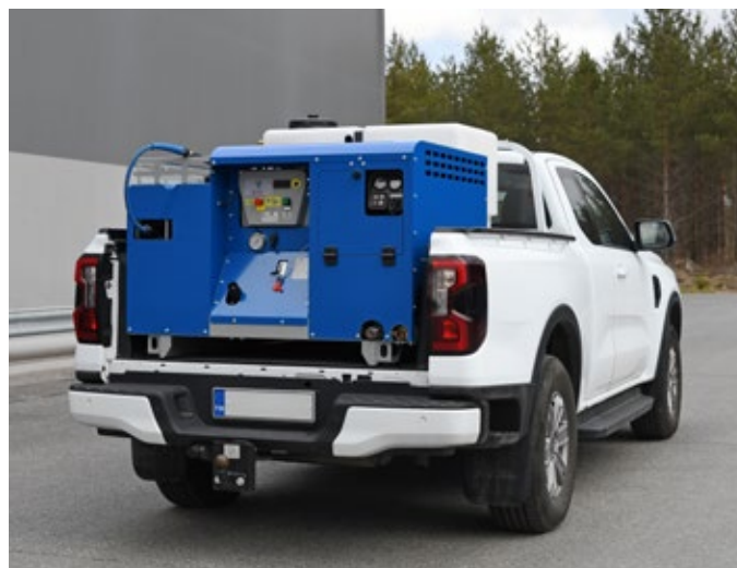
Jet-It™ HT2525HD hot water pressure washer