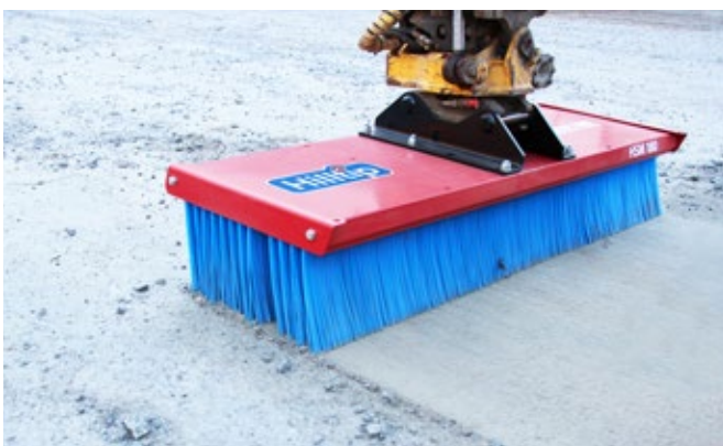
SweepAway™ on excavator