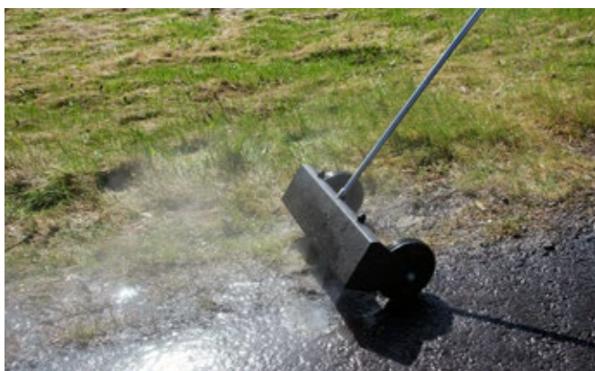
Optional weed control nozzle kit WD 04