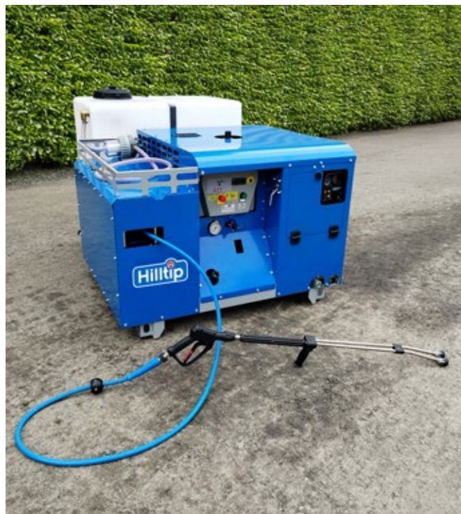
Jet-It™ HT2525HD hot water pressure washer

With the optional weed control kits it's easy to get rid of weeds on walkways and cracks in driveways. Hot water kill weeds ecologically and the treated area is safe to use immediately after the treatment.