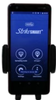
StrikeSmart™ Smart phone control, optional