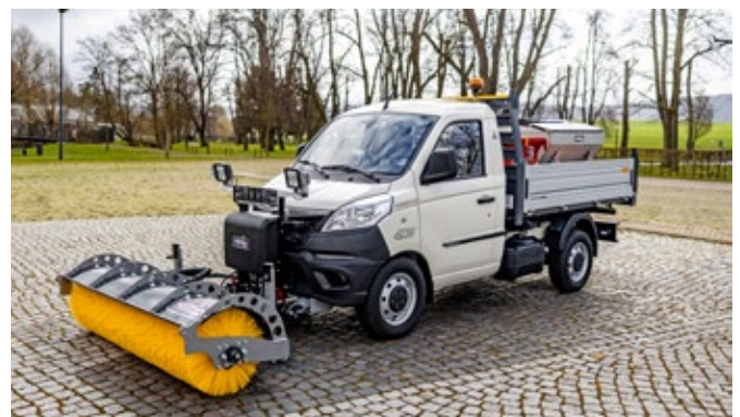
SweepAway™ rotary broom on pickup