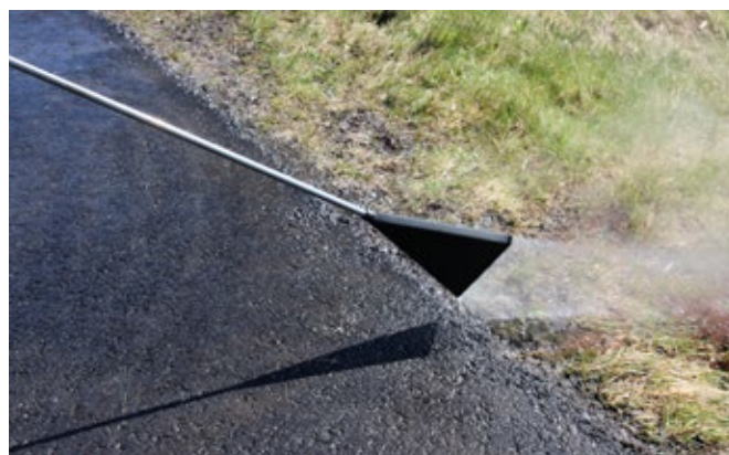
Optional weed control nozzle kit WD 01