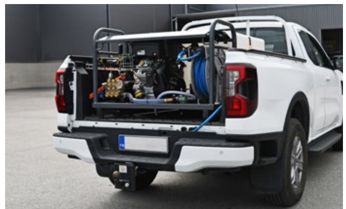
Jet-It™ HT2025ES cold water pressure washer

These versatile 350-1000 l mobile pressure washers are designed for use on pickups, trailers, tractors and other similar equipment. Their wide application areas enable easy washing/spraying of yards, graffiti, gardens, pavements, stairs, roofs, machines, facilities etc.