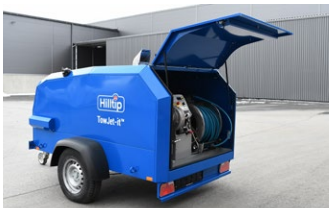
TowJet-it™ towable hot pressure washer

The total weight of the trailer is 1600 kg.