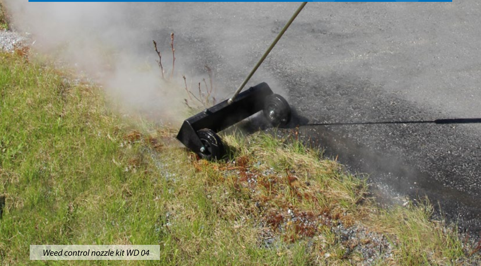
Weed control nozzle kit WD 04