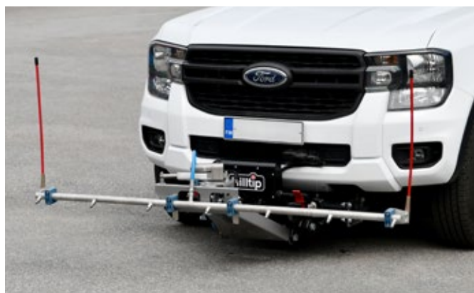
1.8 m front spray bar

With its quick-attachment system and easy-to-use controller, operation is fast and efficient. The spray bar features a 1.8 m working width and a 500–1000 L water tank , ensuring an adequate water supply for maintaining clean, dust-free streets. Thanks to the adjustable front spray bar and a high-performance pump, directing water precisely where needed is effortless.