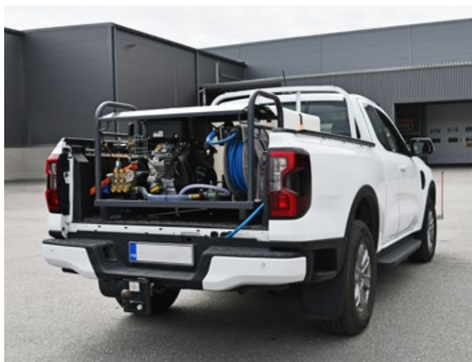
Jet-It™ HT1240ET pressure washer with front spray bar

Specifications and other details are subject to change without notice.