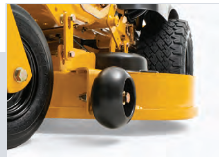
Welded Steel Deck 11 ga. welded fabricated steel deck adds durability & extends the mower's life.