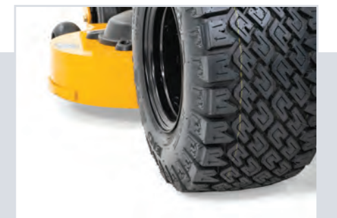
18" BigBite™ Rear Tires