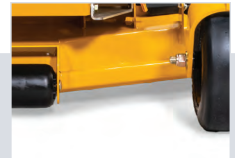
Commercial-Grade Deck 10 ga. with front bull nose bumper