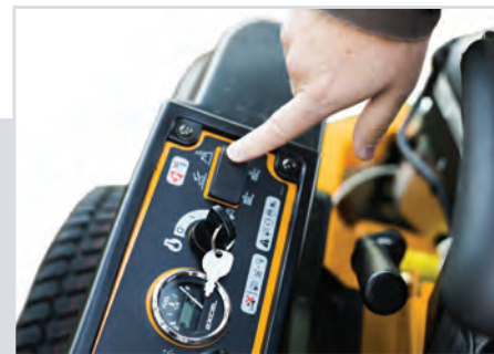
Auto Deck Height Adjustment Raises and lowers deck at the push of a button.