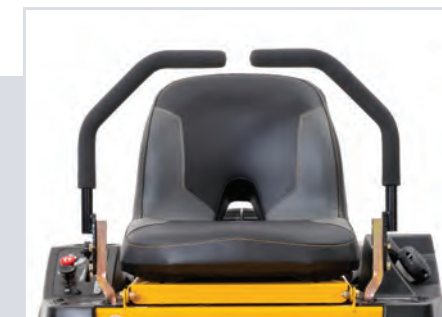
Premium Seat Bolstered with built-in lumbar support.