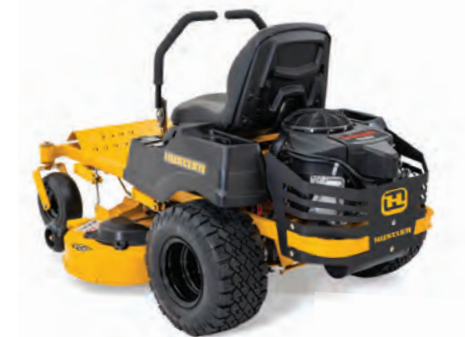
Standard Engine Guard