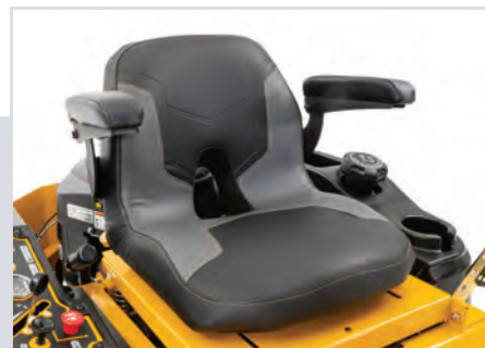
Premium Seat Premium bolstered seat with built-in lumbar support.