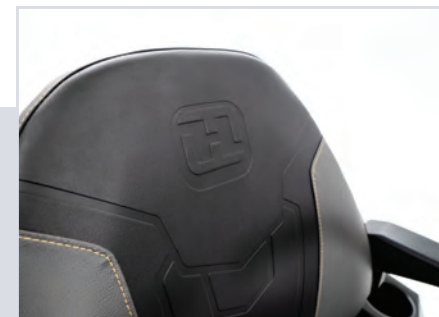
Higher-Back Seat and Added Padding