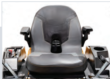
Higher-Back Seat and Added Padding