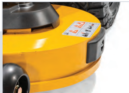
Larger Deck Size Option (60")