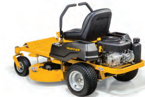
16" Rear Tires

Compact Size Easily fits through most gates making backyard mowing easy and ideal for garage storage.