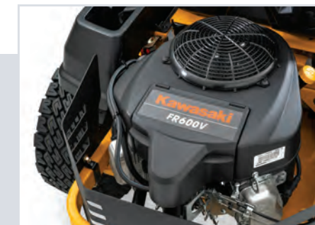
Premium Power V-Twin Kawasaki® engine.