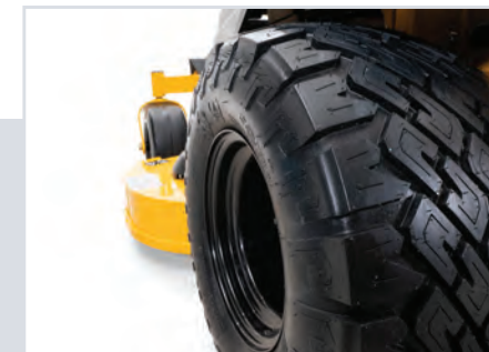
Larger 22" BigBite™ Drive Tires