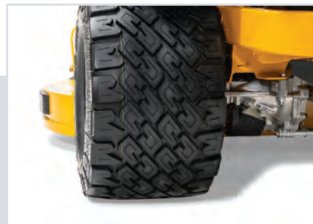
Larger 20" BigBite™ Drive Tires Larger Transmissions Hydro-Gear ZT-2800®