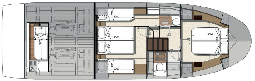
Model available with 2 or 3 staterooms