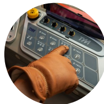
3. Control panel