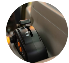
5. Hitch control lever