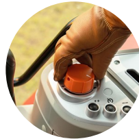
1. Throttle dial

The output of the T654 suggests it's a utility tractor and the turning radius suggests it's a compact tractor. Offering maximized power and ease of control, this compact utility truly brings you the best of both worlds.