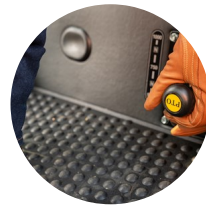
2. PTO shift lever