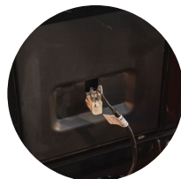
3. Safety seat sensor