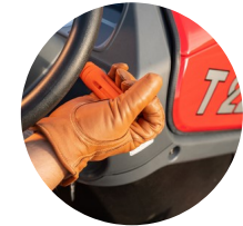
4. Throttle lever