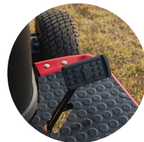
2. 2-range hydrostatic transmission (HST)