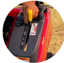
1. PTO lever for mid- and rear rpm

Perform the tasks of a full-size tractor, while enjoying the maneuverability of a ride-on mower. The T224 is the essential TYM sub-compact, serving as an indispensable groundskeeper for every property owner.