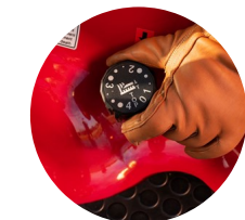
6. Dial adjustment for mower height