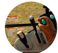
6. Control panel