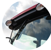
1. Front wipers

Take utilization to the next level with one of the largest TYM tractors. The T1104 is equipped to tackle the toughest of jobs with maximized productivity.