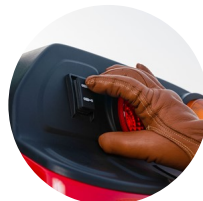
3. External hitch control buttons