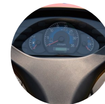
6. High visibility instrumental panel