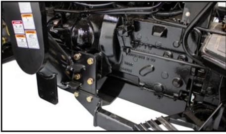
Sliding mesh transmission with 8 forward and 2 reverse gears