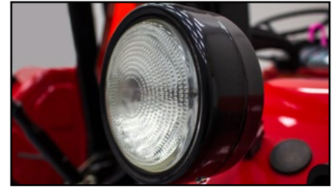
Optional rear worklight for low light conditions