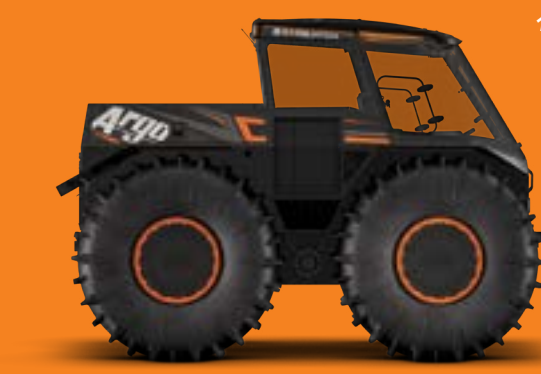
157" (3,988 mm)