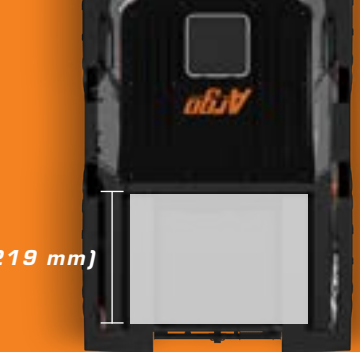
2,645 LBS (1,200 kg)