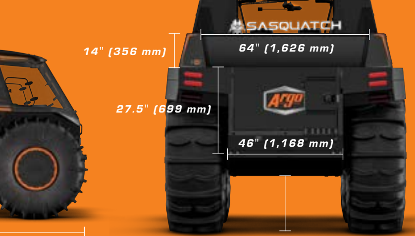
26" (660 mm)