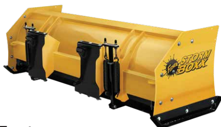
Tractor Attachment Plates