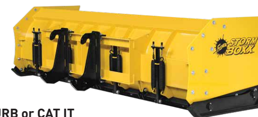
JRB or CAT IT Attachments

Designed to keep the cutting edge level on uneven surfaces to maintain a clean scrape and a more even cutting edge wear.