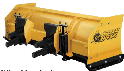
Wheel Loader/Backhoe Attachment Plates