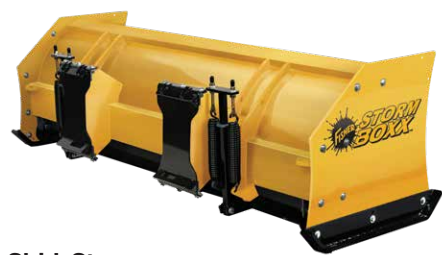
Skid-Steer Attachment Plates

Consult your local FISHER dealer or fisherplows.com for accessory compatibility and availability.