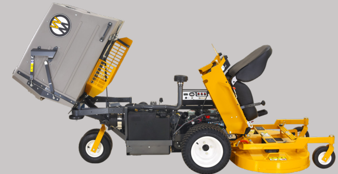
Tilt-Open and Tilt-Up bodies quickly expose engine and drive train for service and easy maintenance.

Standard on all Walker decks is the tilt-up function. This feature makes blade and deck housing maintenance easy and safe. This is a considerable advancement in mower design when compared to jacking up the mower and laying on the ground to access the deck.