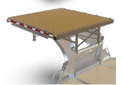
8' x 8' FRONT DECK