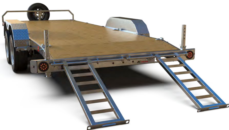
SLIDE-IN RAMPS (10,000-LB MODELS)