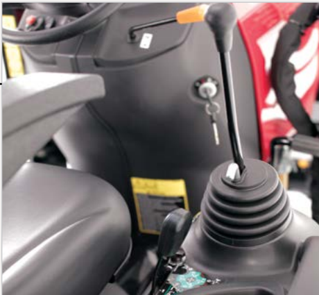
Work comfortably with armrest-mounted loader control lever, while True Position Control lever (below joystick) delivers precise operating height of rear implements.