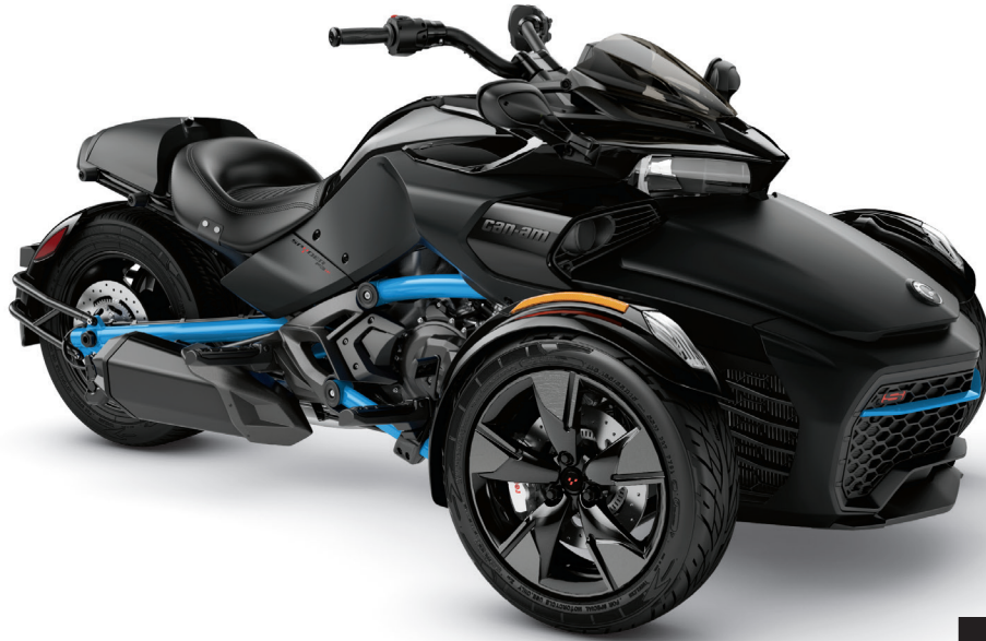
■ MONOLITH BLACK SATIN