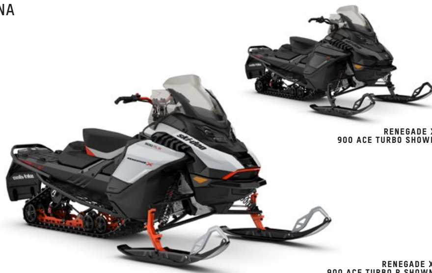
RENEGADE X 900 ACE TURBO SHOWN

High-tech features and racing DNA for hardcore trail riders.