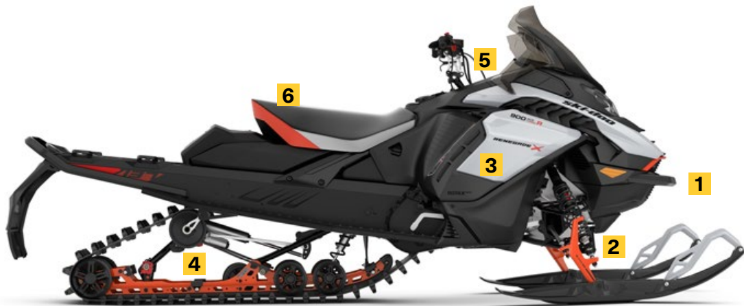
RENEGADE X 900 ACE TURBO R SHOWN

Now the most powerful 4-stroke engine ever offered. Ferocious instant acceleration and top speed through bigger fuel injectors, increased boost and optimized intake and exhaust systems. The new cable activated iTC™ throttle better matches a performance rider's profile while offering three driving modes.