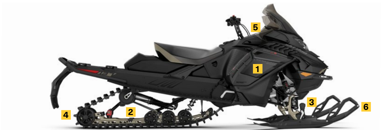
RENEGADE ADRENALINE WITH ENDURO PACKAGE 900 ACE TURBO R SHOWN

Flatter cornering and precision handling in all conditions. Wider, adjustable ski stance and +10mm of suspension stroke maximize stability, capability and comfort.