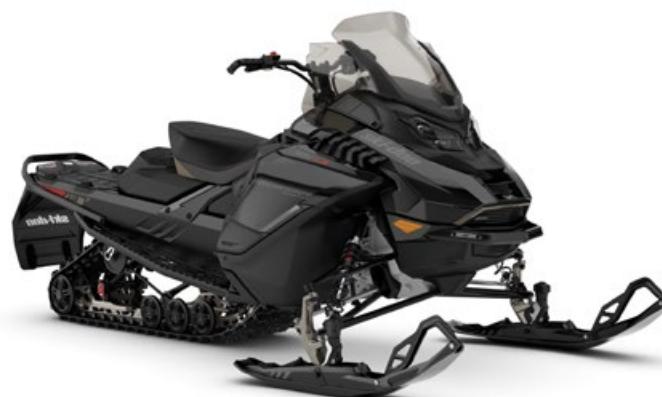
RENEGADE ADRENALINE WITH ENDURO PACKAGE 900 ACE TURBO R SHOWN

Adventure-ready with top-tier technology, comfort and performance.