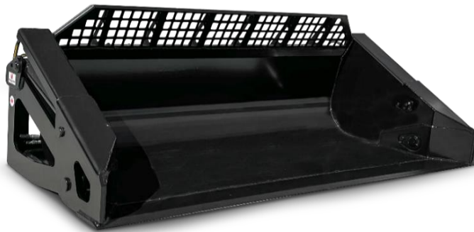
Normal Capacity High Dump Bucket