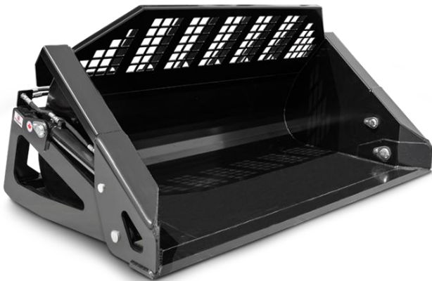
High Volume High Dump Bucket