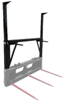
3 Prong Bale Spear Back Rack