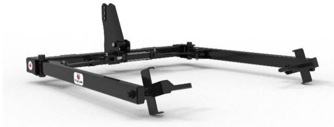
Round Bale Unroller