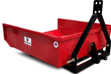
3 Point Hitch Dump Box