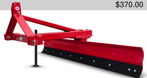
Heavy duty grader blade

>MULTIPLE SIZES FOR EVERY RATING OF TRACTOR