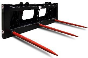
3 Prong Bale Spear