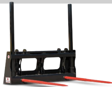
Double Prong Bale Spear

BALE SPEARS DO NOT COME WITH VERTICAL UPRIGHT POSTES