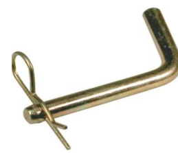
BENT HITCH PIN