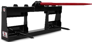
Single Prong Bale Spear