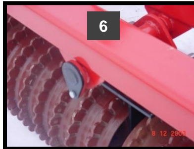
Rugged 1 3/4" hinge pins, securely fastened