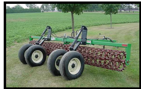
Shown with Dual Wheel Transport Kit