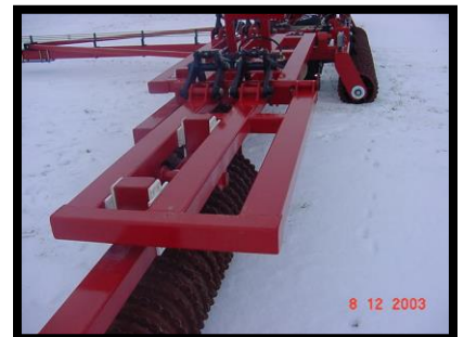
3 beam outerwing section w/ two cylinders, each packer gang oscillates on centre pin and plastic wear plates