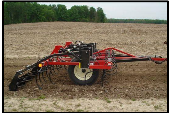
Shown with option rolling baskets