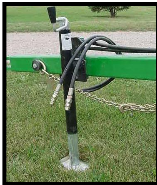
Tongue Jack Safety Chain