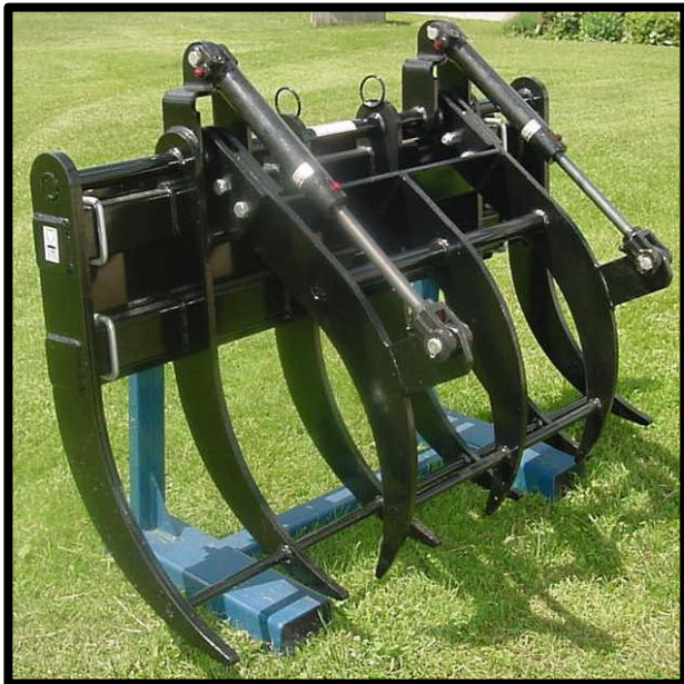
Shown with 3 claw solid assembly