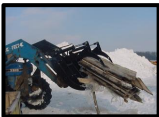
Logs & Slabs

The Big Jim Multipurpose Grapple is available with Frey, Alo and Skid Steer quick attach brackets and universal pin brackets (1" diameter pin). The Grapple consists of 3/4" thick x 5" deep teeth. Teeth are tied together with 1 3/4" and 1" diameter round bar and reinforced with 4" x 2" x 1/4" wall tubing on back side of grapple. Teeth are spaced 12" centres to allow dirt to pass through, but still pick up branches, roots, and many other objects. Several different claw options are available to suit the customers' specific requirements.