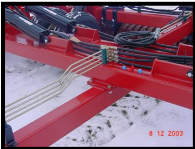
All plumbing neatly arranged and tied in place

Ductile Wheels carry a 3 year limited warranty.