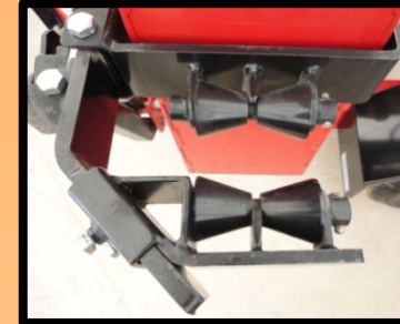
Standard Round Post Hugger