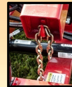
Transport Lock Chain on Tilt Assembly