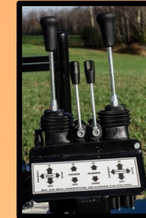
Joystick Control Valve