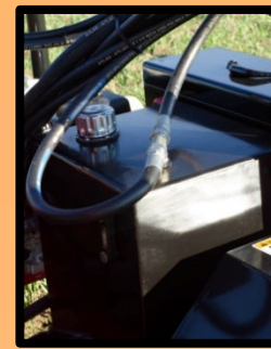
Large 15 Gallon Oil Reservoir

The Hammer and Mast in fully raised position reaches a height of 11' 6" from the hammer to the ground.