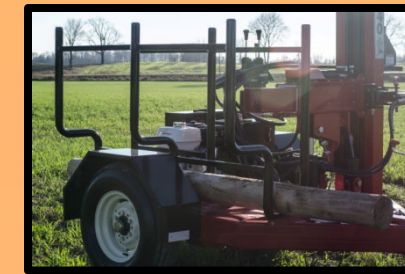
Post Carrier Rack