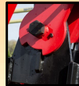
Forward/Backward Tilt Stop Tab