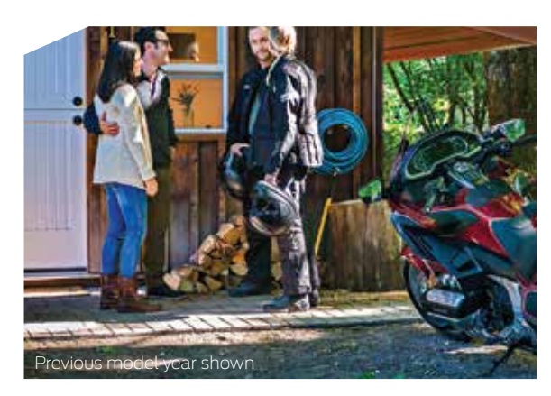
Designed with long-distance touring in mind.