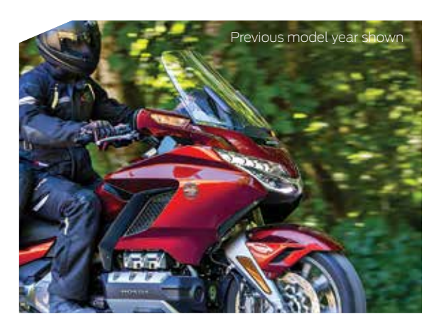
Brilliantly bright LED-formed "wing line" headlights.

Stripped-down style with attractive saddlebags and no rear trunk.