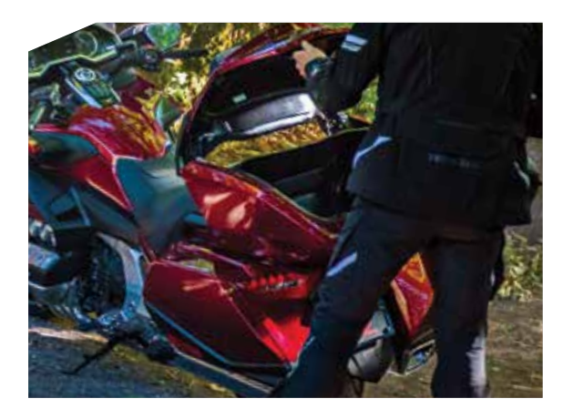
Luggage has been designed with sweeping integrated storage.