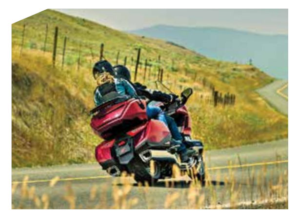
A fully-dressed tourer, designed and equipped to maximize your travel experience.

The agile body of the Gold Wing is up to 39 kg (85 lb.) lighter than the previous generation and continues to be equipped with with the latest in technology, including Apple CarPlay<sup>™</sup> integration and selectable