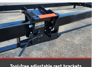
Tool-free adjustable rest brackets