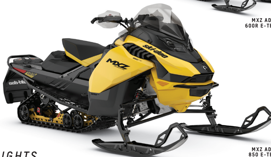
MXZ ADRENALINE 850 E-TEC SHOWN