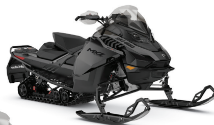
MXZ ADRENALINE 600R E-TEC SHOWN

Tight cornering, big bumps, high speed and rough trails — this sled conquers it all.