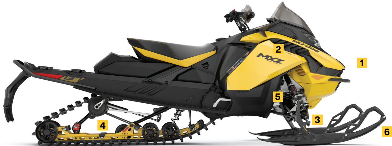
MXZ ADRENALINE 850 E-TEC SHOWN

Conquer every inch of the most challenging trail conditions with confidence with the snowcross race inspired RAS RX front suspension. Designed specifically for rough trail performance with 20% less chassis roll for better cornering stability.