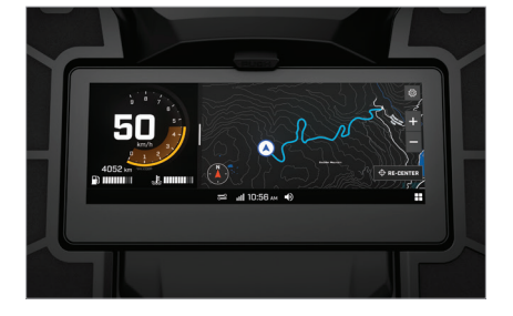
5 10.25 in. color touchscreen display with BRP Connect and built-in GPS

Weight-saving ultra-compact deep snow seat to make technical maneuvers easier than ever.