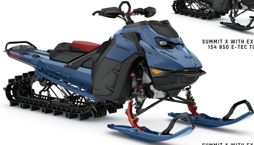
SUMMIT X WITH EXPERT PACKAGE 165 850 E-TEC TURBO R SHOWN