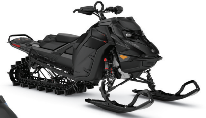
SUMMIT X WITH EXPERT PACKAGE 154 850 E-TEC TURBO R SHOWN

The ultimate precise and predictable deep-snow sled with features sharpened for most technical terrains.