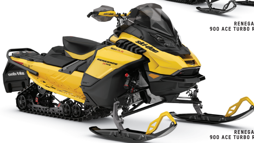
RENEGADE X-RS 900 ACE TURBO R SHOWN