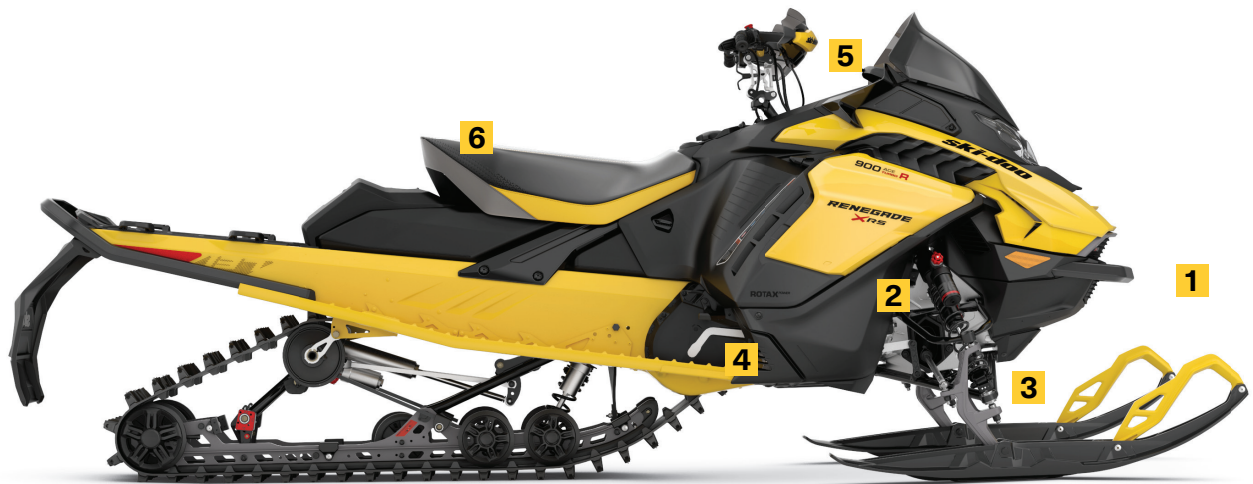
RENEGADE X-RS 900 ACE TURBO R SHOWN

Extreme-capability, extreme-durability shocks for control in the toughest conditions. Easy adjust-equipped for dialed-in compression.