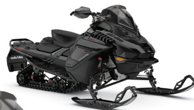
RENEGADE X-RS 900 ACE TURBO R SHOWN

A hard-charging, high-performance machine with the most advanced features and technology.