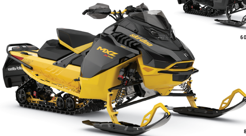
MXZ X-RS 850 E-TEC SHOWN