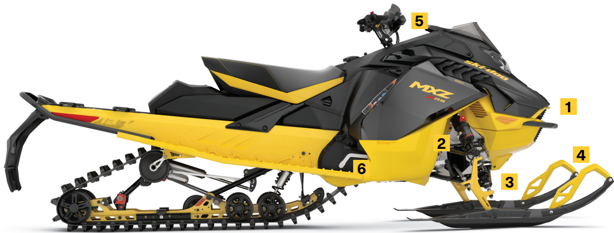
MXZ X-RS 850 E-TEC SHOWN

Conquer every inch of the most challenging trail conditions with confidence with the snowcross race inspired RAS RX front suspension. Designed specifically for rough trail performance with 20% less chassis roll for better cornering stability.