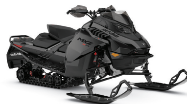
MXZ X-RS 600R E-TEC SHOWN

A non-compromising race-inspired sled capable of taking on the roughest trails with ease.