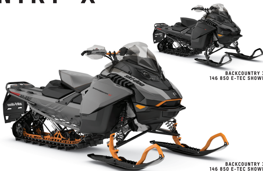
BACKCOUNTRY X 146 850 E-TEC SHOWN

A 50-50 sled with the most advanced technology, plus off-trail capability and rough-trail performance.