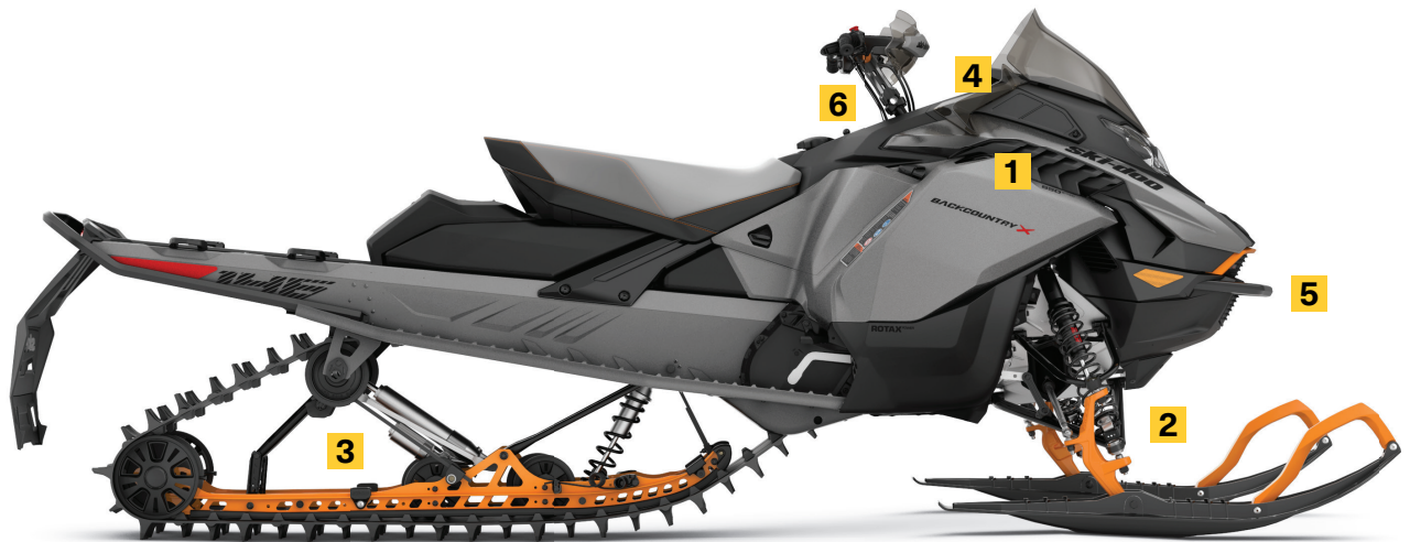
BACKCOUNTRY X 146 850 E-TEC SHOWN

Completely new lighter design is better balanced for performance on- and off-trail. Perfectly balanced weight transfer for an increased fun factor and more travel for more comfort and bump absorption.