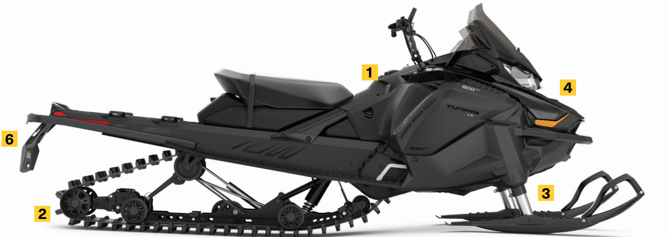
TUNDRA LE 600 EFI SHOWN

Industry-exclusive telescopic front suspension enables a large, flat belly pan for exceptional deep-snow flotation.