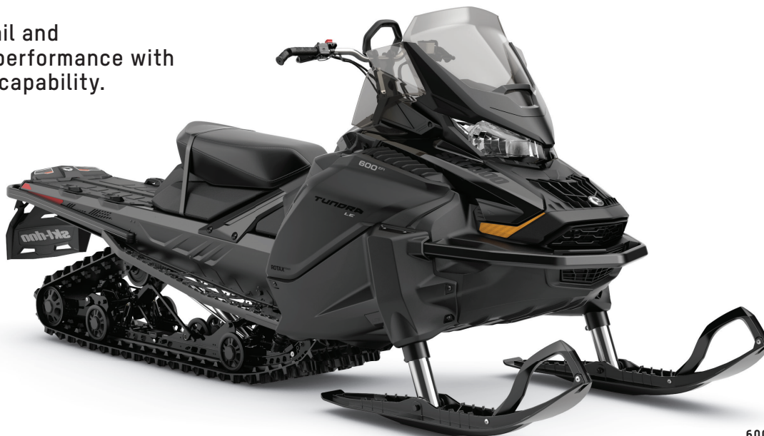
TUNDRA LE 600 EFI SHOWN

Great off-trail and deep-snow performance with light-utility capability.