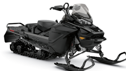
EXPEDITION XTREME 850 E-TEC SHOWN