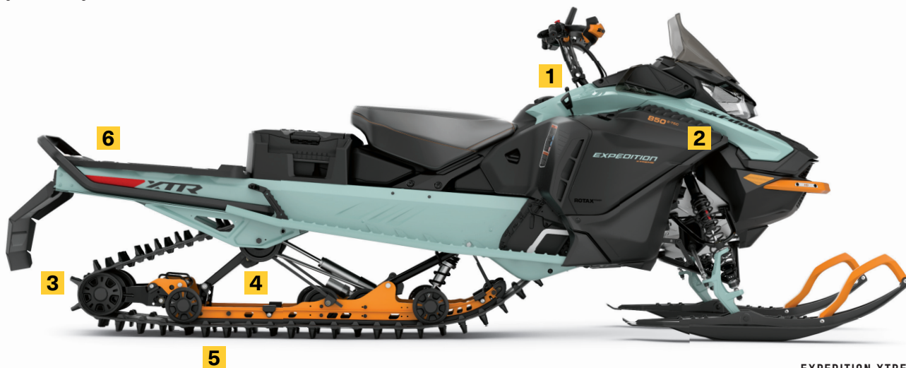
EXPEDITION XTREME 850 E-TEC SHOWN

The REV Gen4 platform paired with the RAS X crossover front suspension allows effortless maneuvers in deep-snow, while the 20 x 154 x 1.8 in. Cobra track provides incredible flotation and traction.