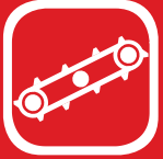
Paddle Belt Conveyors