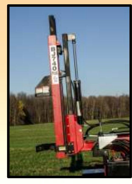
The Mast lifts hydraulically 24 inches. This allows a fast change from 8 to 10 foot posts. This feature also allows a longer hammer stroke for starting 8 foot posts.

The Mast travels out 16 inches and the tongue travels out 24 inches. This enables the operator to accurately place posts without moving the entire machine.