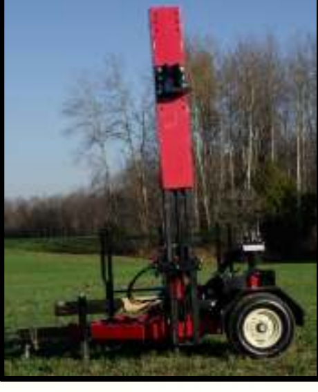
The Hammer and Mast in fully raised position reaches a height of 11' 6" from the hammer to the ground.