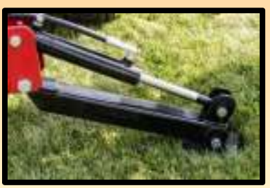
Standard Hydraulic Stabilizer Arm on Plus Model ONLY; Provides enhanced stability when in outward and raised positions.

All Big Jim Post Drivers come with built in safety features to prevent injury in the event of a sudden hydraulic failure. All units come complete with a DOT approved safety chain on tongue.