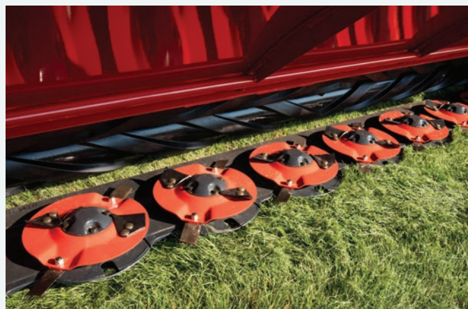
Rubber Chevron intermeshing rolls

Sharp knives give you the clean cut you want with less crop left behind. As a result, you harvest more tons, get fast regrowth and assure your forage quality for the next cutting. Keeping knives sharp is easy with the standard quick-change knife system. It allows you to change damaged knives fast or flip an entire set and get back to mowing pronto to keep on your mowing schedule.