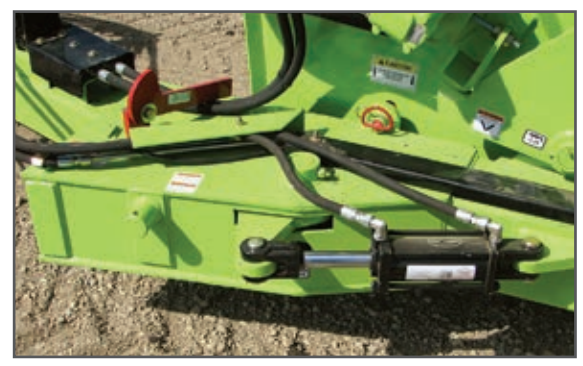
Optional hydraulic swing hitch