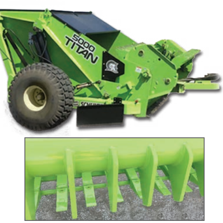
450 BNH steel for heavy duty windrowed picking