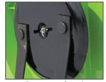
7 gauge spun formed stump jumper pans