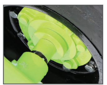
Metal seal guards on 517 hubs