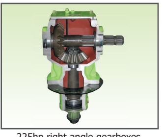
225hp right angle gearboxes, Heavy duty 1 3/4" input shafts, 2 3/8" down shafts