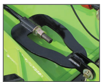
Single levelling rod with floating hitch