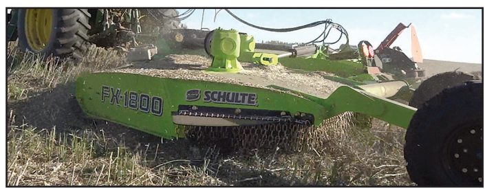
Outboard blade rotation on fixed knife model keeps material from balling up under the deck