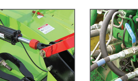
Single center lock up system