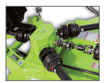
Heavy duty drive system for peak performance