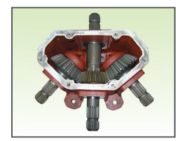
260hp heavy duty splitter box with 1 3/4" splined shafts