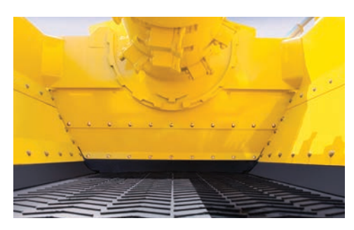
HIGH PRODUCTION. Designed to handle more production with less clogging, the 48" (122 cm) wide continuous undermill conveyor system offers optimum speed and capacity.