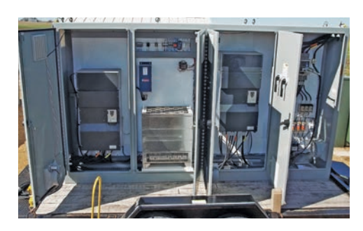
MOTOR CONTROL PANEL. The motor control panel provides options to configure a control system that best fits your application.