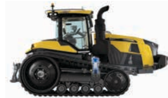
Figure 2: The MT800 Series, with Smart Ride Plus, allows for easy adjustment of the weight distribution. This results in reduced slip, improved ride comfort, and improved overall performance.