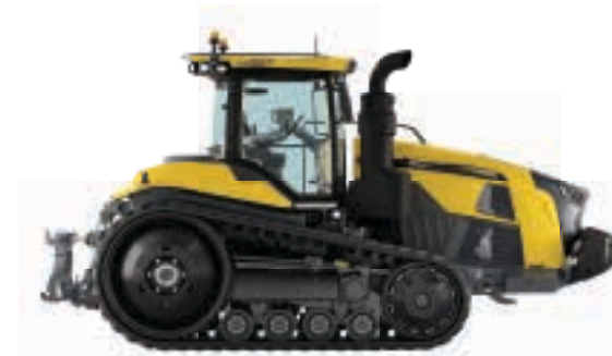
Figure 1: A tractor goes to work without proper tractor and implement weight distribution. This results in insufficient front weight on the tractor, and as a result increases slip.

When equipped with Smart Ride Plus suspension, the MT800 Series features a load-leveling suspension system. With the push of a button in the cab, Smart Ride Plus uses hydraulic pressure in the track suspension elements to raise or lower the front of the machine. This results in better weight distribution for better traction, ride, and overall performance.