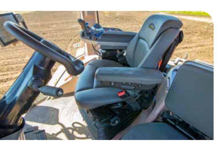
Help lessen operator fatigue with the optional deluxe vibration reduction system (VRS) vented leather seat with semi-active suspension.

Once you settle in the ultra-comfortable operator's seat you'll notice nearly unobstructed views and sight lines. You'll be visually and physically connected to all the on-board operating systems and controls. We don't want to say we've thought of everything. But, yeah, we've thought of everything.