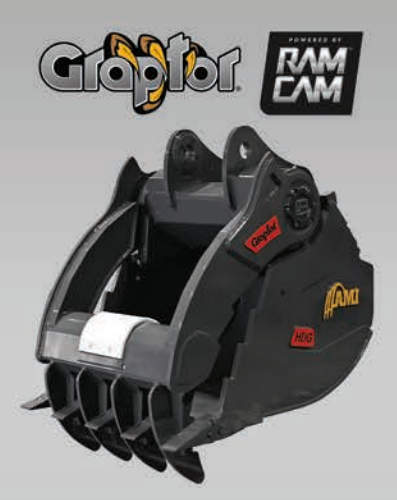
The Graptor<sup>®</sup> powered by RAMCAM<sup>™</sup> works with hydraulic cylinders which are fully enclosed. The built-in rotary thumb gives operators improved flexibility and precision by maintaining constant grip on the load.

Adding productivity and purpose to any excavator, AMI Attachments offers a complete line of products for compact, midsize and large production excavators. Designed to withstand the rigours of earthmoving and material handling, excavator attachments built by AMI feature Hardox<sup>®</sup> Wear Plate and Strenx<sup>™</sup> Performance Steel.