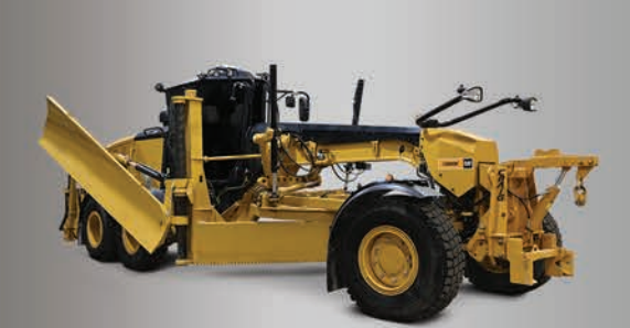
Rear or front mounted wing blades for motor graders for productive road clearing.