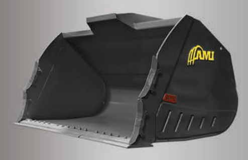
A true 2-pass bucket with 10-yard capacity on every load.