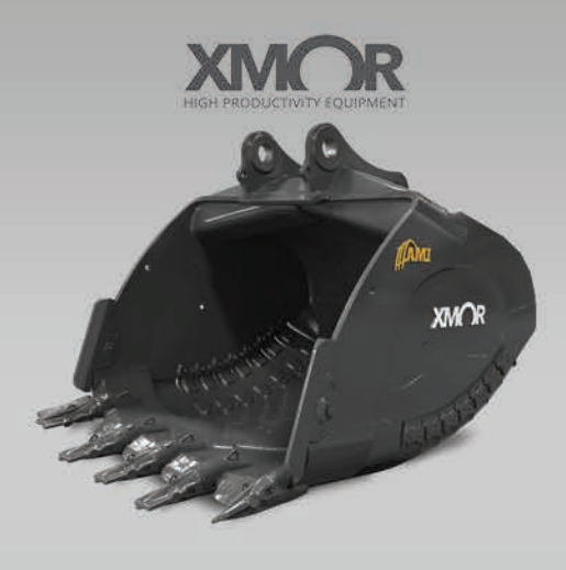
Unlocking your excavator's true payload, the XMOR<sup>®</sup> is designed to handle up to 30% more material and is 20% lighter.