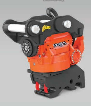
The AXXIS<sup>™</sup> Tiltrotator has no cylinders for clean, compact and hassle-free tilting and rotating movements.